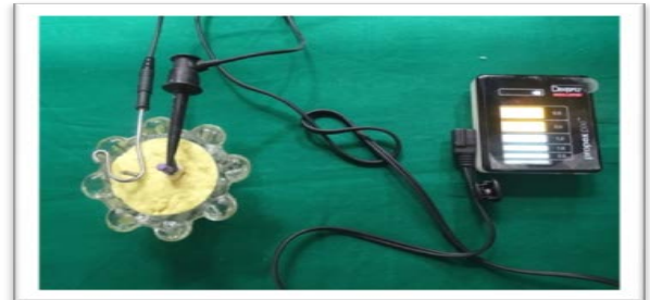
Figure 3: Experimental set-up for PROPEX PIXI