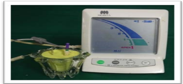
Figure 1: Experimental set-up for ROOT ZX

For Propex PIXI, the marking of 0.5 mm was considered [Figure 3].