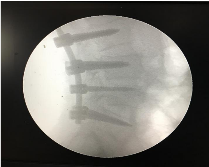
Fig 4: Intra operative fluoroscopic image of lumbosacral spine after decompression and posterior instrumentation.