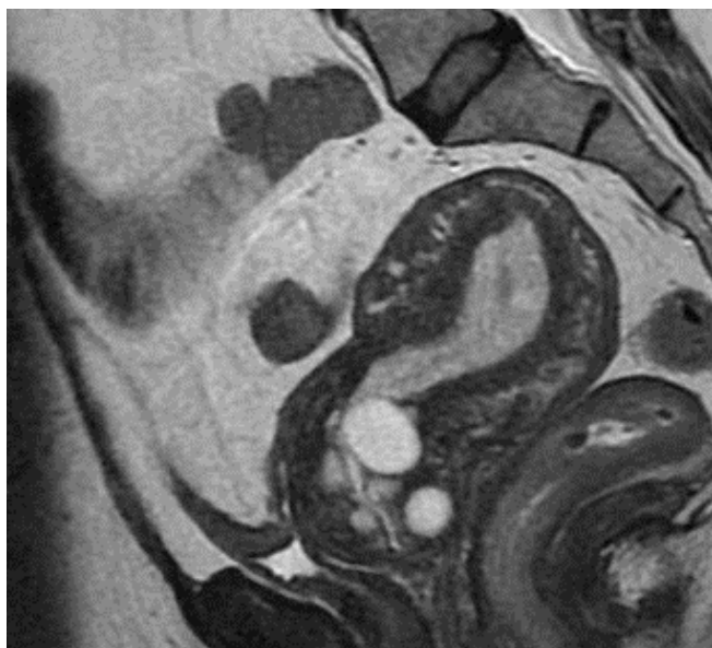
Figure 1: Stage 2 disease with cervical invasion. Multiple nabothian follicles noted in the cervical canal