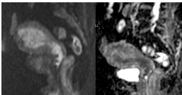
Figure 2: Diffusion weighted imaging and ADC mapping shows restricted diffusion extending to the cervical canal with widening of cervical canal- features consistent with stage 2 disease