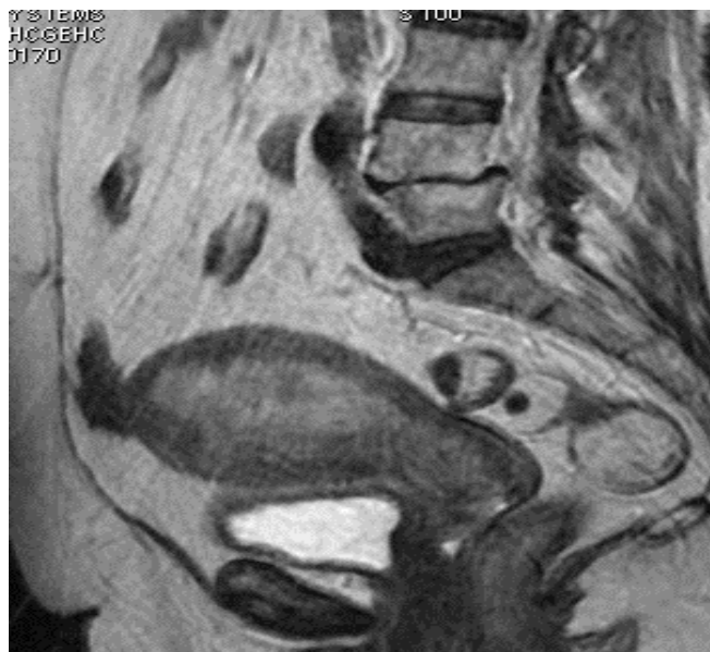
Figure 3: T2W sagittal image showing myometrial invasion and cervical invasion stage 2 d/s