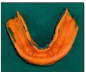
Impression recorded with A-silicone