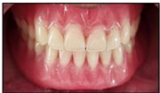
Final prosthesis- frontal view