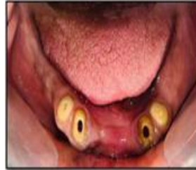
Post space preparation for cast post with #33 & #43