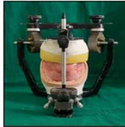
Final mounting with centric record