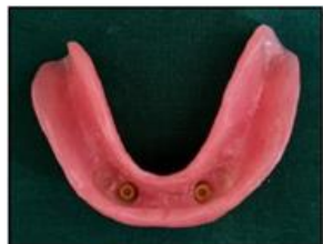
Trial of female attachments