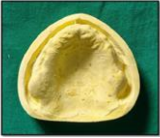
Master cast of maxillary arch