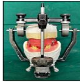
Mandibular arch mounting