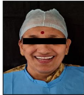
Post-operative extra-oral view