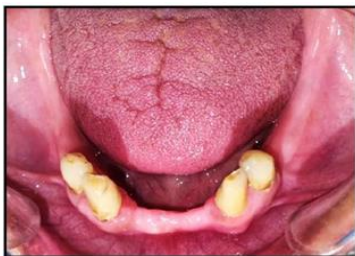
Pre-operative intra-oral view (Mandibular arch)