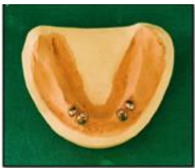
Casted attachments on cast