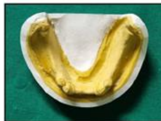
Primary cast of mandibular arch