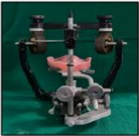
Facebow transfer on a semi-adjustable articulator