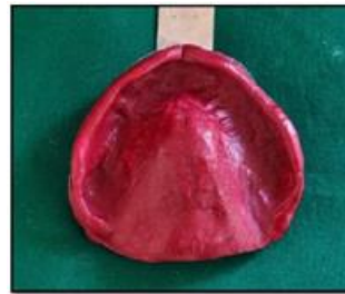
Primary impression of maxillary arch

and polished followed by insertion. The post-insertion instructions were given to the patient and follow up recalls were done after 24 hours, one week and one-month intervals.