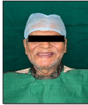
Pre-operative extra-oral view