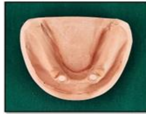
Final master cast