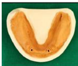
Final mandibular cast with post-space