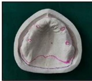
Primary cast of maxillary arch