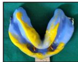
Mandibular impression with post-space