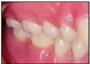
Occlusion- right lateral view