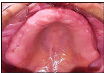
Pre-operative intra-oral view (Maxillary arch)

Based on the clinical and radiographic findings, it was decided to fabricate a conventional maxillary complete denture and a mandibular ball attachment retained with 33 and 43 and coping attachment with 34 and 44, tooth supported overdenture. The patient was informed about the proposed treatment plan and a consent was obtained.