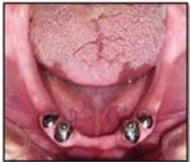
Casted attachments cemented with the luting GIC