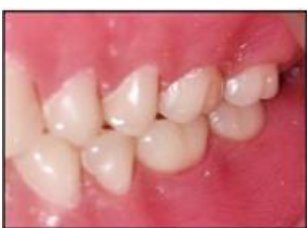
Occlusion- left lateral view