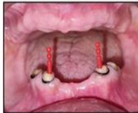
Placement of pinjet for stability of post space impression