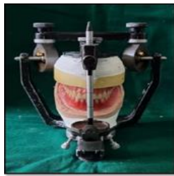
Teeth arrangement in MIP