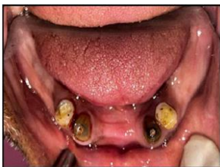
Pre-operative intra-oral view (Mandibular arch)