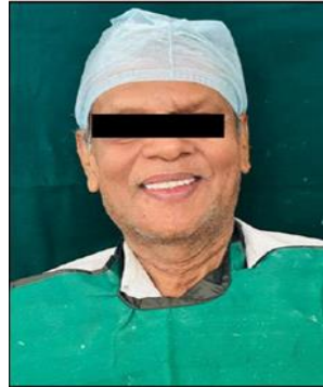
Post-operative extra-oral view