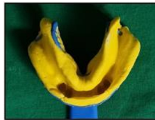
Primary impression of mandibular arch