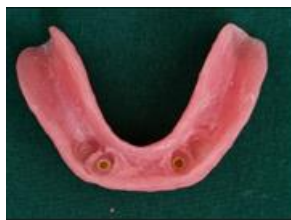
Pick-up of female attachments with cold cure acrylic material