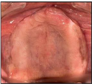
Pre-operative intra-oral view (Maxillary arch)

Intraoral examination revealed completely edentulous maxillary arch and partially edentulous mandibular arch with teeth remaining- 33, 34, 43 and 44. The remaining teeth were non-carious and had good periodontal support. The canines i.e., 33 and 43 were treated with root canal. The maxilla-mandibular relation was Class I with adequate inter-arch space present in the premolar region. Based on the clinical and radiographic findings, it was decided to fabricate a conventional maxillary complete denture and a mandibular ball attachment retained with 33 and 43 and coping attachment with 34 and 44, tooth supported overdenture. The patient was informed about the proposed treatment plan and a consent was obtained.