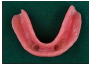
Final acrylization with space for female attachments