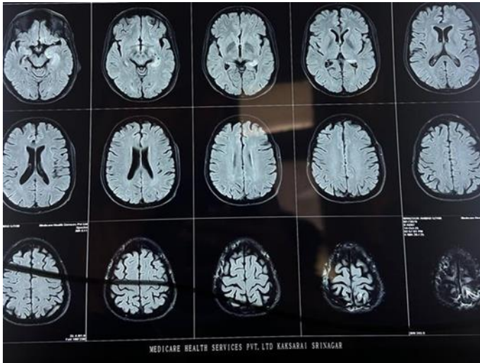
Figure 2: MRI axial DWI showing associated inflammatory changes without restriction, supporting autoimmune encephalitis diagnosis.

Figure 1: MRI axial images showing bilateral medial temporal hyperintensities on FLAIR sequence.